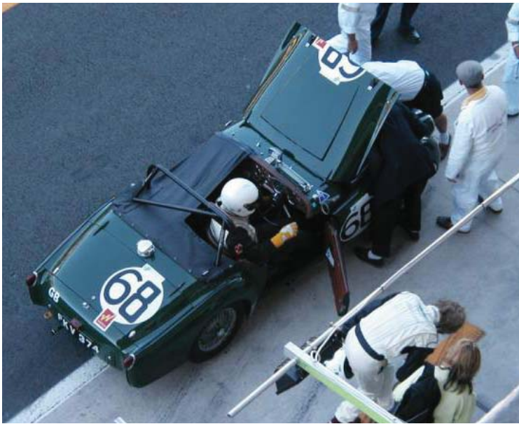
when he visited Le Mans