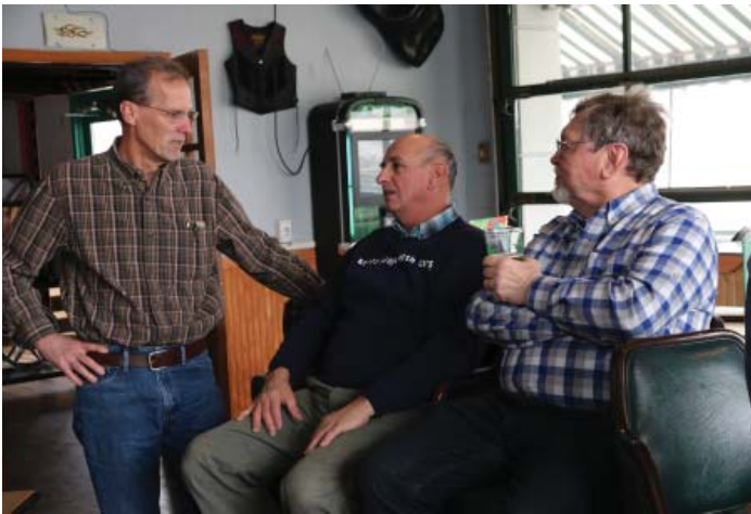
The Hickory delegation