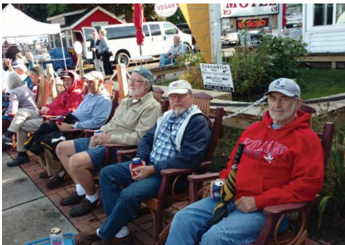
Old guys rule! Rocking chairs on Franklin Street.