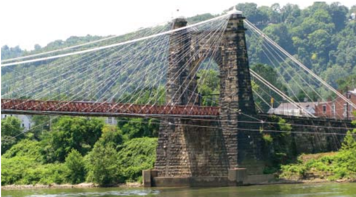
The Bold and The Beautiful Tour; see article on page two.