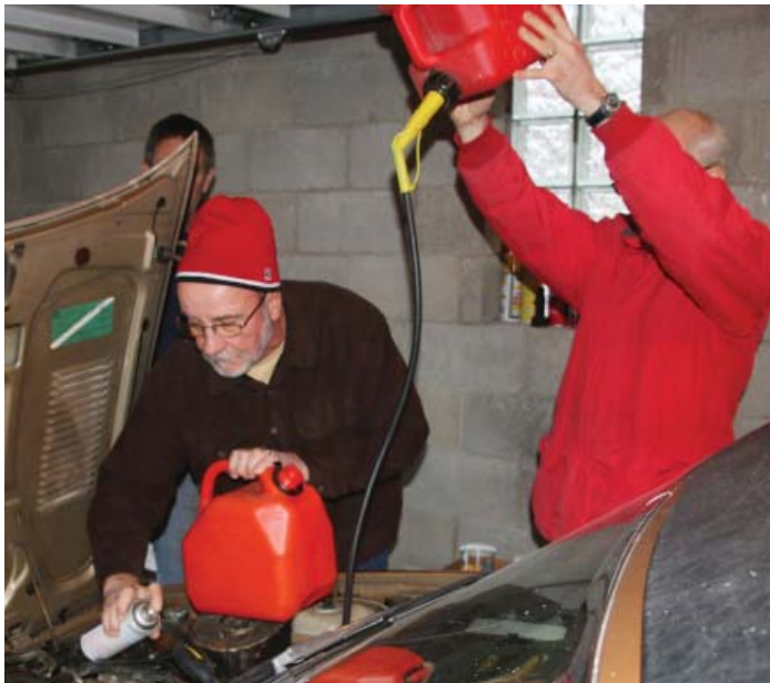
Ok; this doesn't look dangerous at all!