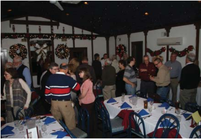
Holiday Party -- More Next Month