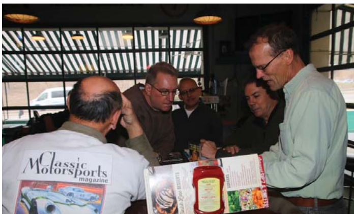
So what's the plan?