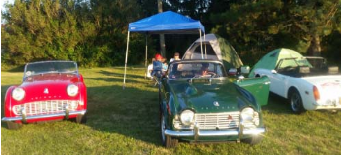
The WPTA Camp