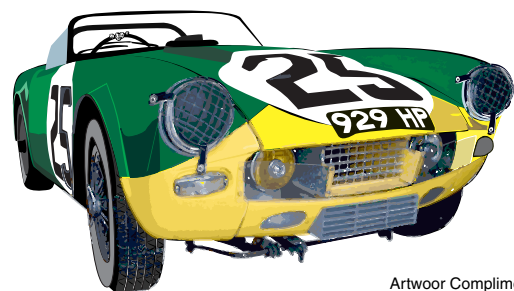
Artwork Compliments of TRF

There is a little know function on The Roadster Factory's web site called "Your Wish List". This allows you to store a list of TR parts you would like to have. You need to have a user name and account with the site, and then you can add and delete items from any TRF catalog or their parts database. If something you "wish for" on the list goes on sale, it turns red and shows you the sale price. During one of TRF's recent half price sale about $100 worth of TR6 stuff went on sale so I got it all for about $50. I simply transferred the items to a cart and purchased only the ones with a great price. If nothing else it's a good organizer for all your Triumph parts needs.