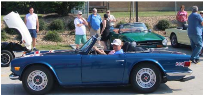
Red Bandana Run Candid