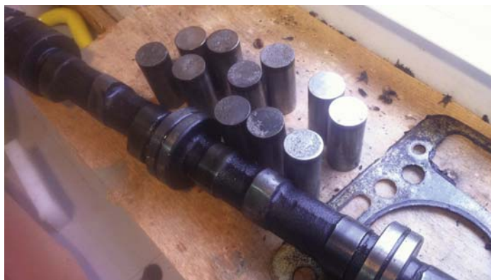
Hershey's wiped out cam shaft

Mark your calendars for February 21 . That is the day we will have our annual run to Team Triumph. Plan to meet at Perkins restaurant in Cranberry at 8:00 for breakfast. We will caravan to Team Triumph in Warren after breakfast for a day of scrounging through parts and BSing about cars in general and Triumphs in particular. As always, we will head to a local establishment afterwards for a late lunch. Additional details in next month's newsletter.