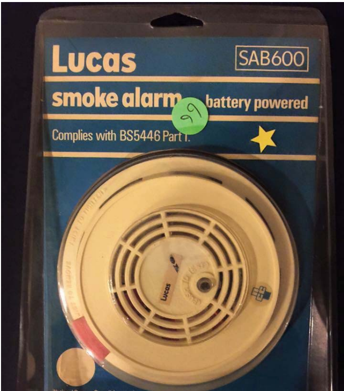
Installs easily under the dash!