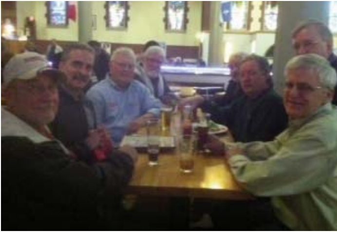
The Church Brew Works