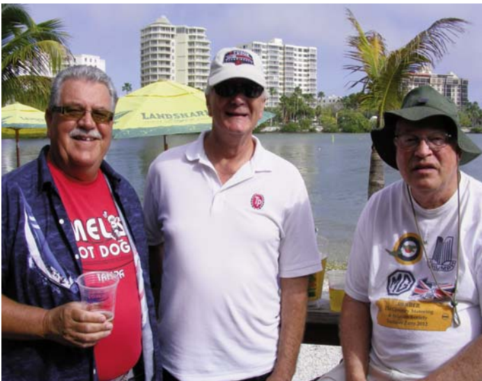
February Dzus Dnuz meeting, Sarasota Bay Florida