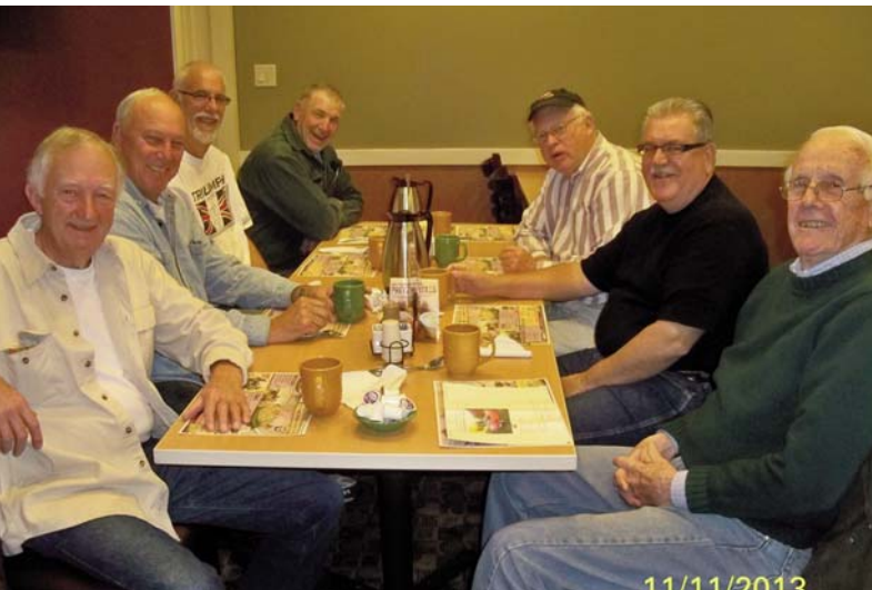
Cars & Coffee was well attended in November.