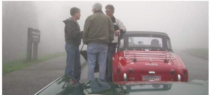
In the fog on the Blue Ridge Parkway

I'd do this trip again with this group of men. We had more fun than should be allowed. And, most of what happens on these trips never gets told, you have to be there to experience it.