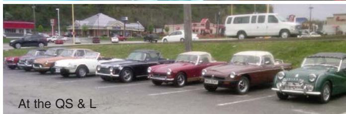
At the QS & L