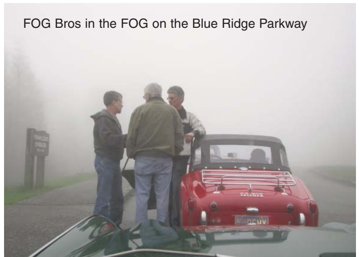
FOG Bros in the FOG on the Blue Ridge Parkway