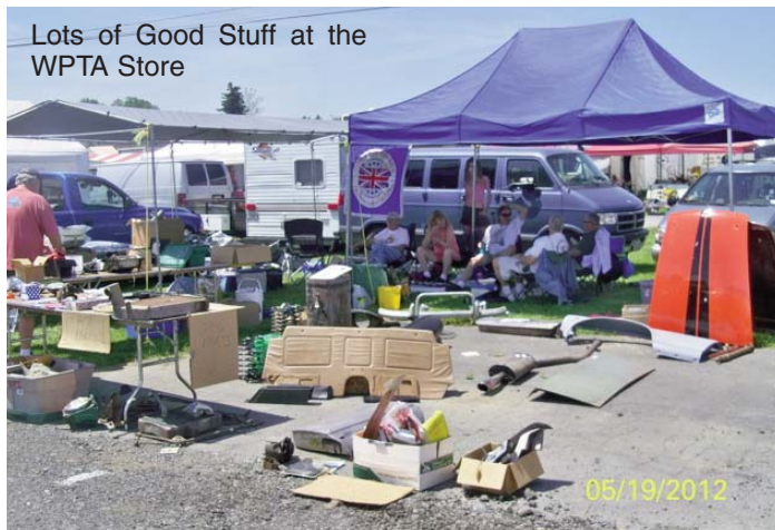
Lots of Good Stuff at the WPTA Store