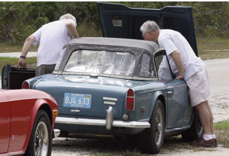
A minor adjustment in route