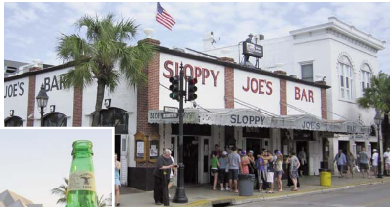
No Captions needed!

Then north to South Beach for lunch and a hotel on the beach at Fort Lauderdale for the night. The next morning we continued north on Route A1A to Daytona Beach and St. Augustine where we spent the night. Friday morning we delivered the TR250 in Jacksonville and flew back to Pittsburgh that evening. A 10 day "most excellent" TR adventure.