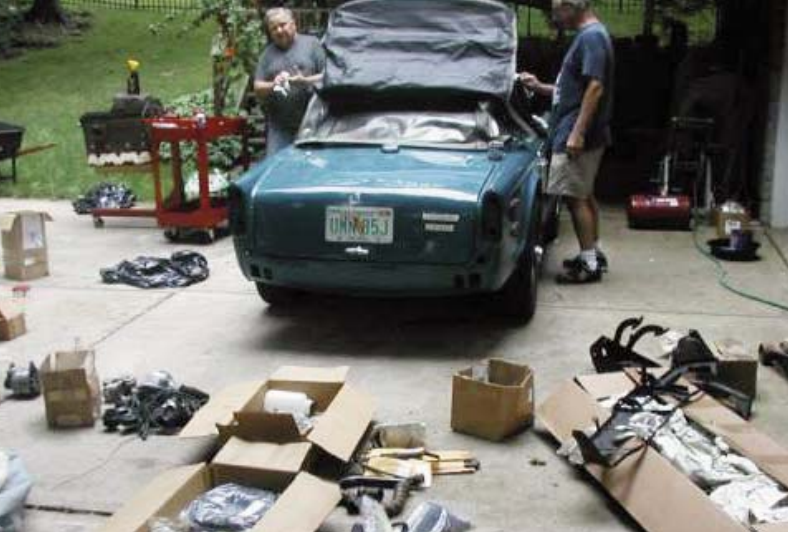
In the beginning