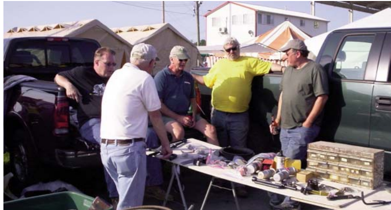
At the WPTA spaces in Carlisle

A good time is guaranteed and what happens at Carlisle stays at Carlisle. PS: I almost forgot; you better take an umbrella or rain jacket.