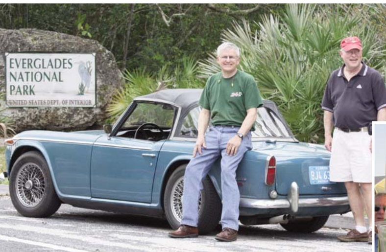
Fun guys in the Everglades