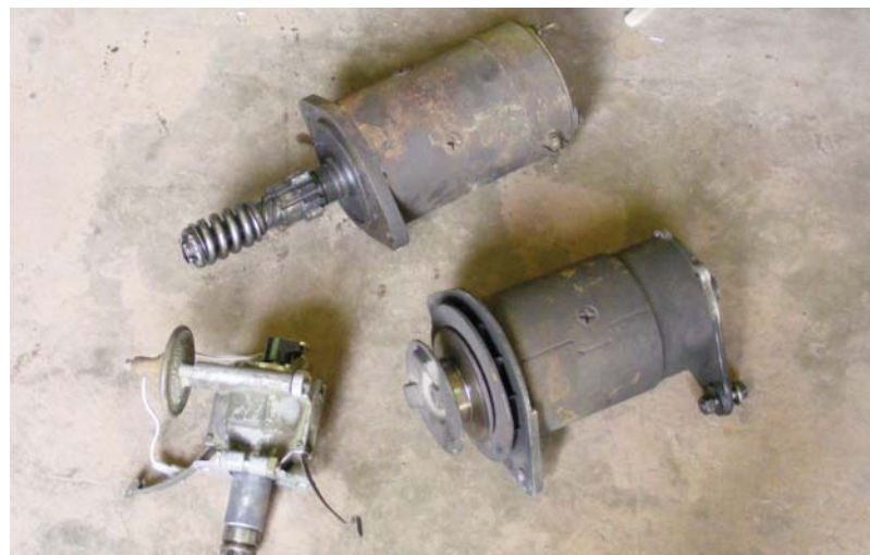
The diseased organs