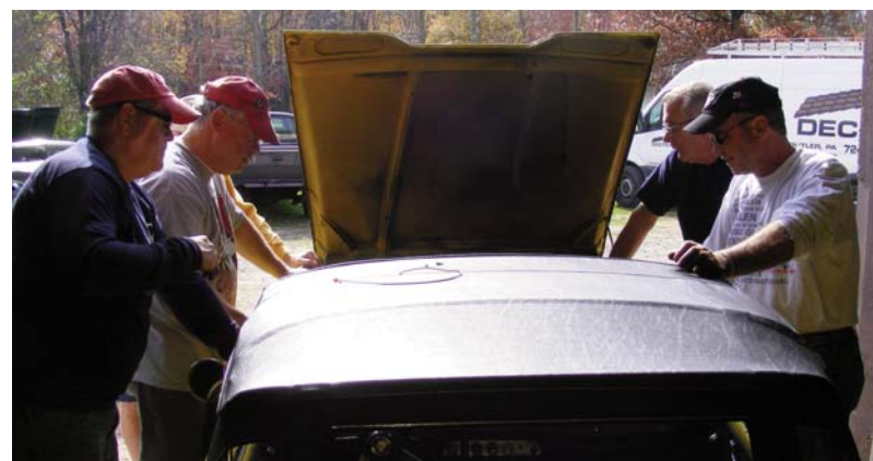
The surgeons at work