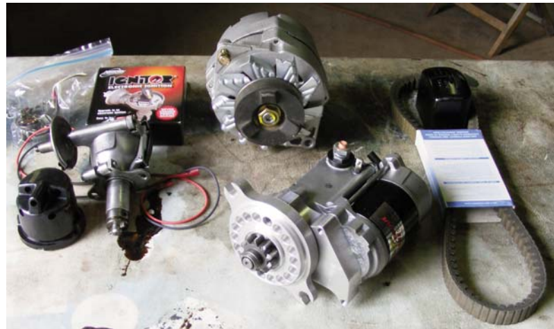
The new organs awaiting transplanting