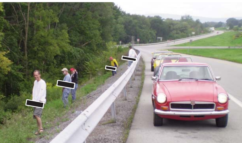
After visiting the Eternal Tap, Members adhere to FOG RULE #1 never miss an opportunity to take a bathroom break