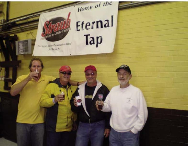
Drinking the Eternal Tap Dry