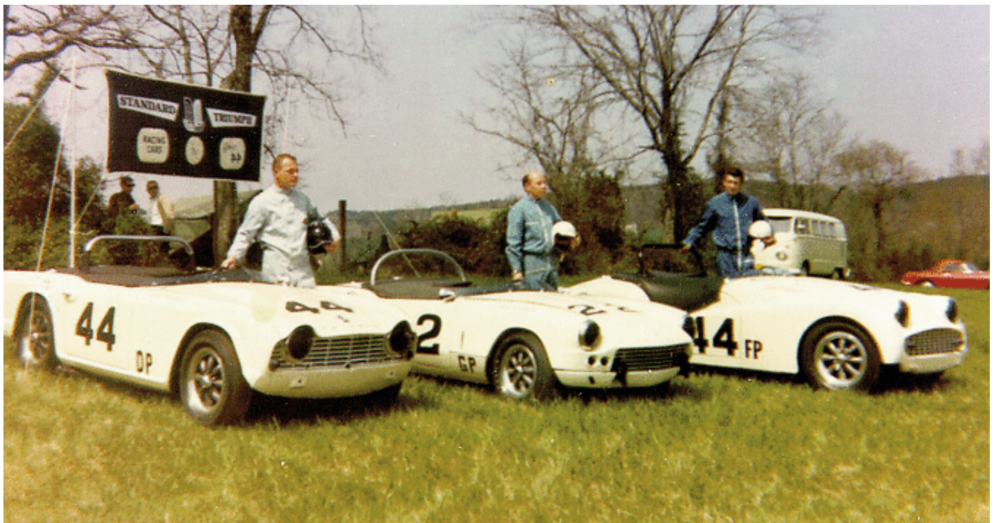
Group 44 - 1966