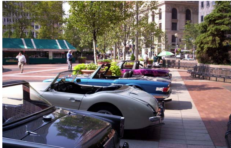
Club members cars on display at the USX Tower.

For this very busy month we will again schedule only one Cars & Coffee breakfast. On Wednesday September 17 we will meet for breakfast at the world famous Carlton Kitchen. No, it's not the Ritz-Carlton. This Carlton Kitchen is a combination diner, motel, and church (when was the last time you saw that grouping?) located immediately off exit 31 of I-70 about a mile west of Bentleyville. Look for the giant "FOOD" sign. For you back road buffs, the restaurant is located at the intersection of McIlvaine Road and Carlton Drive in zip code 15314. Breakfast is good and it's reasonable, including a mixed egg, meat and potato dish called "slop". As always, meet in the parking lot around 9:15 and move in to breakfast at about 9:45.