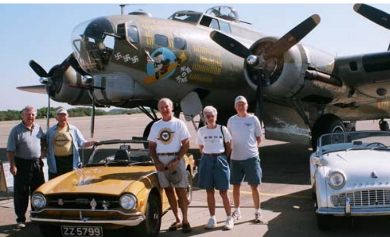
Club members at the Wings Of Freedom Tour with a B24