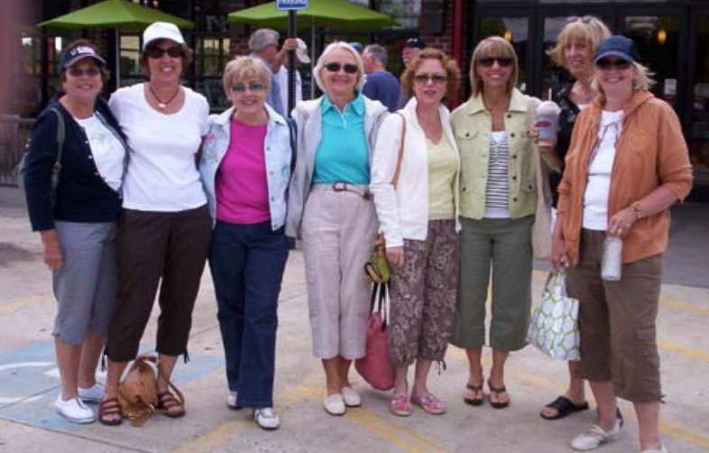
Some of the navigators at the Sheetz pit stop on the run to the Red Star Grill and Brewery