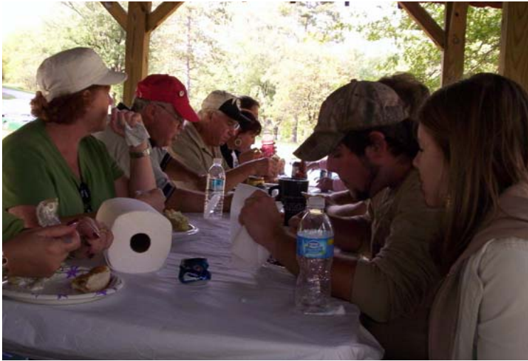
Dogs With Hogs 2008