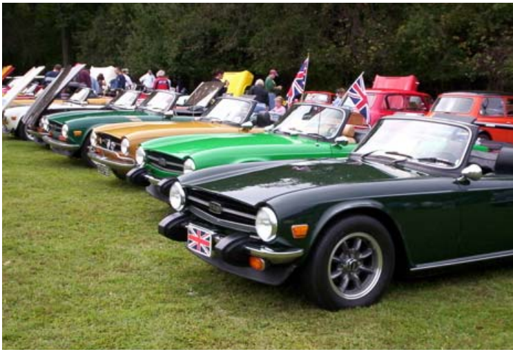
The line-up at Hartwood Acres