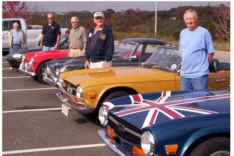
Cars And Coffee in October