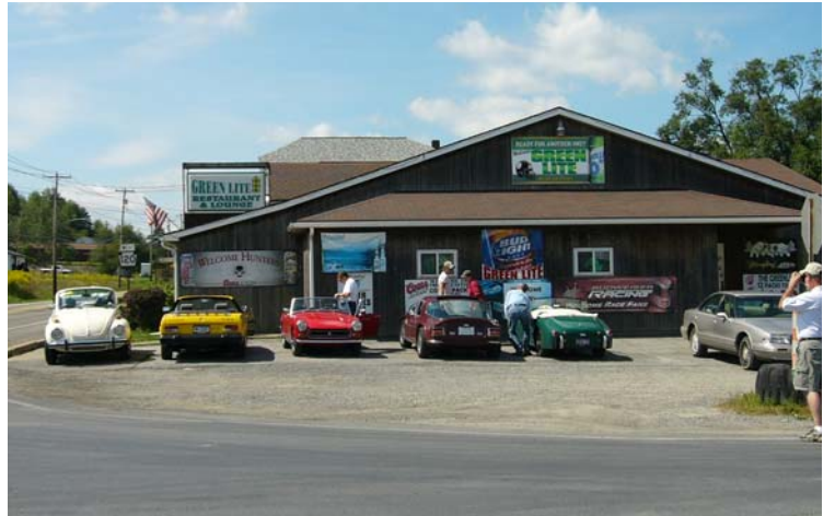
On the road back from the Glen