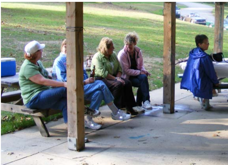
Some of the ladies at Dogs With Hogs