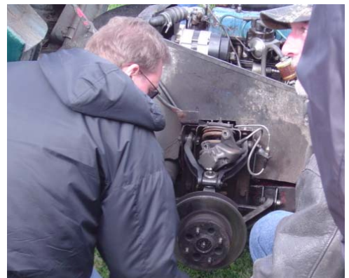
WPTA members "pack" TRF

Actually knowing these guys, it does not surprise me that they would show up on a Sunday to get Gary on the road again.