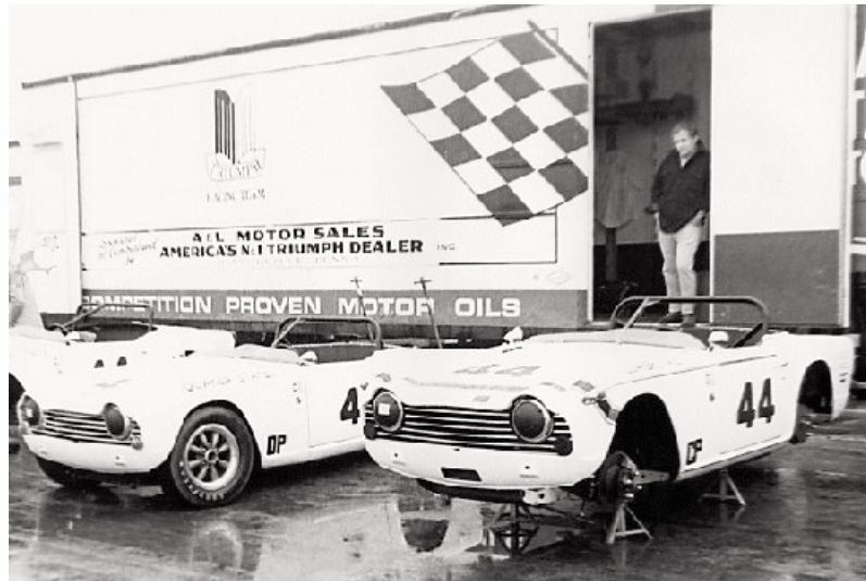
Group 44 Racing, circa 1968, check out the A & L Motors advertizment on the car hauler

FOR SALE: Free to good home, 73 TR 6 body shell, Rust in rockers and other places. Floors good, trunk floor good. Also for sale TR 6 left and right front fenders $80 each. TR 6 Deck lid $75. Call Jim Shaw at 412 262 3878