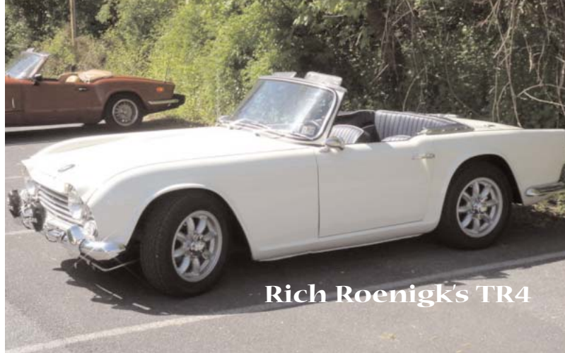
Rich Roenigk's TR4

In Part 4 we will talk about some easy tests we can do to troubleshoot the system.