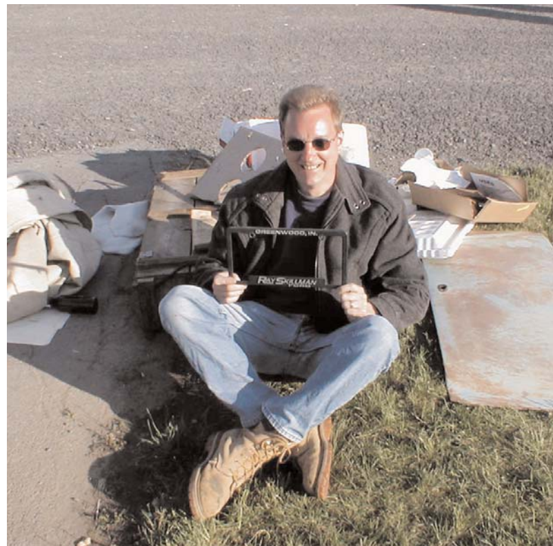
Why is this man smiling? Can you say SOLD!