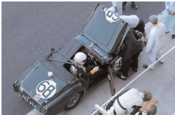
Overhead shot of a TR2 at LeMans 2005

14. In the Pittsburgh area, flipping someone the bird is considered a polite Pittsburgh salute. This gesture should always be returned.