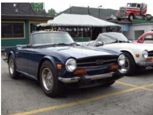
(D) Very original late model blue TR6, highly detailed with black interior and red lines