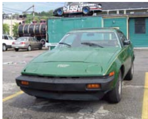
(B) This rare hardtop sports both a factory canvas sunroof and automatic transmission