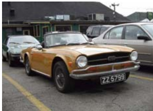
(A) Early Saffron Yellow TR6 with AMCO bumper guards and wire wheels

How well do you know your WPTA Cars and it's members? below are some of the participants from the Quaker Steak Run, test your knowledge by matching the car to it's owner and win a six pack of something. Please submit all answers to kmikos@adelphia.net. The first correct reply wins!