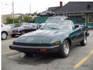
(C) Green TR7 soft top, restored to concours condition