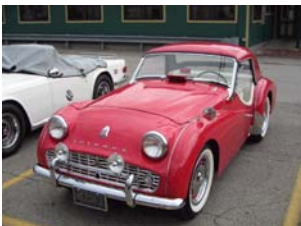
(E) A pristine TR3 with wide whitewalls and an interior to match