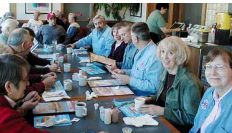
February Meeting Photos by Wil Schweitzer