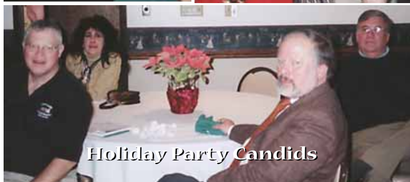
Holiday Party Candidis