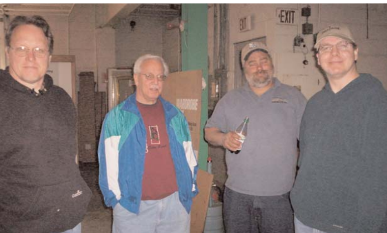
Who's working on the cars?