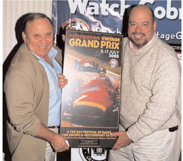
Below: The guys with the beautiful plaque presented to WPTA by The Pittsburgh Vintage Gran Prix Association.