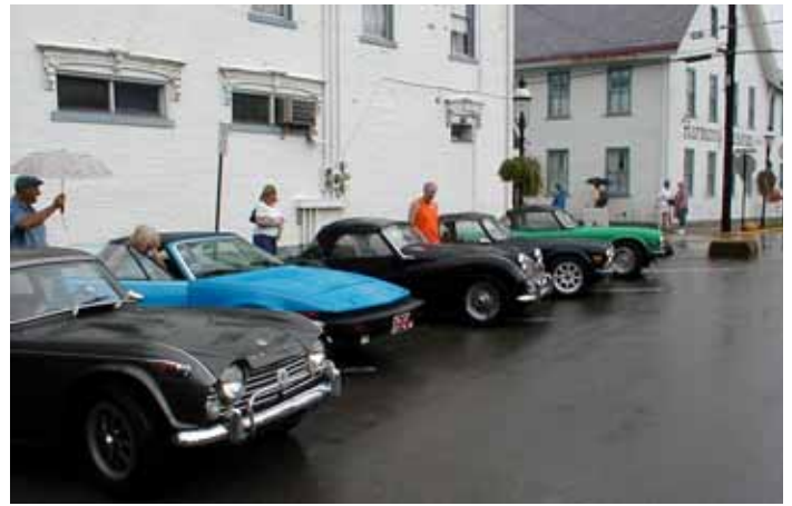
Dankfest, Harmony PA