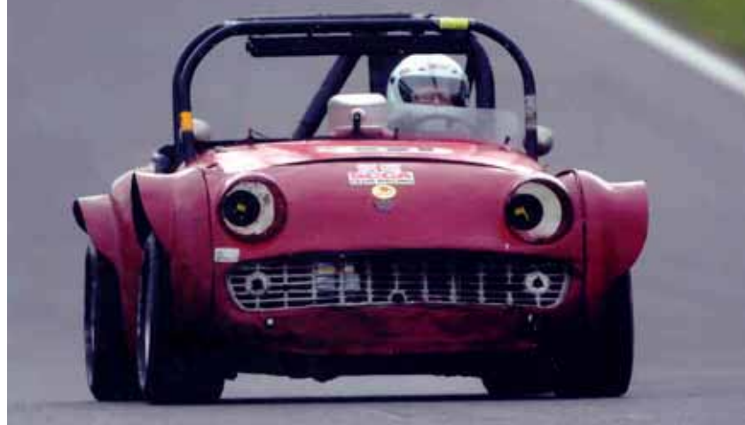
Bill at Watkins Glen in 2004