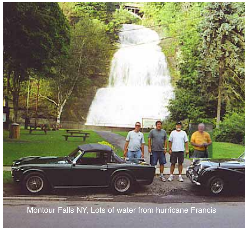
Montour Falls NY, Lots of water from hurricane Francis

Monday our tour guide, Bruce, had plotted out another route home. Again a quart of coffee in Bruce, no quarts for the cars and we hit the road for Pittsburgh. Fog slowed us a bit in the early morning, but gave way to a beautiful day of TR driving. Watkins Glen, historic track and racing history, just more reasons to own, drive and enjoy your Triumph sports car.