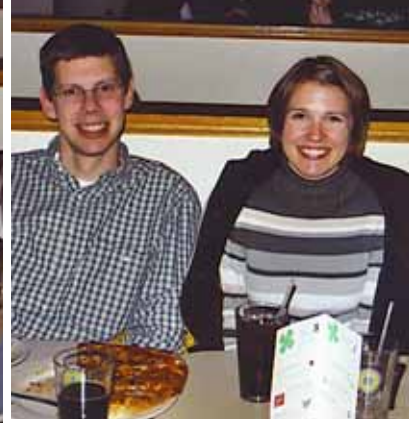
Proof that we're not all FOGs