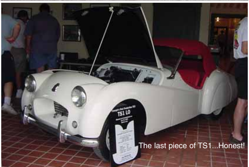
The last piece of TS1...Honest!