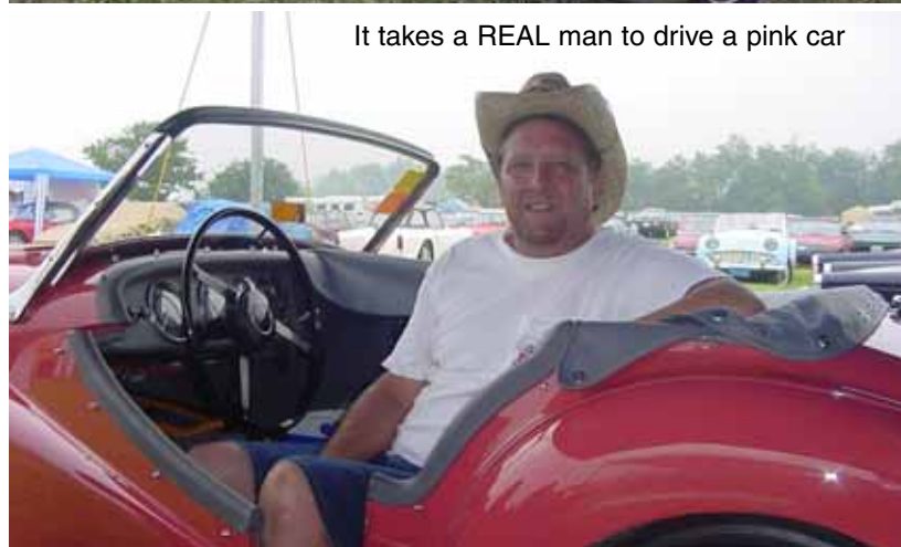
It takes a REAL man to drive a pink car