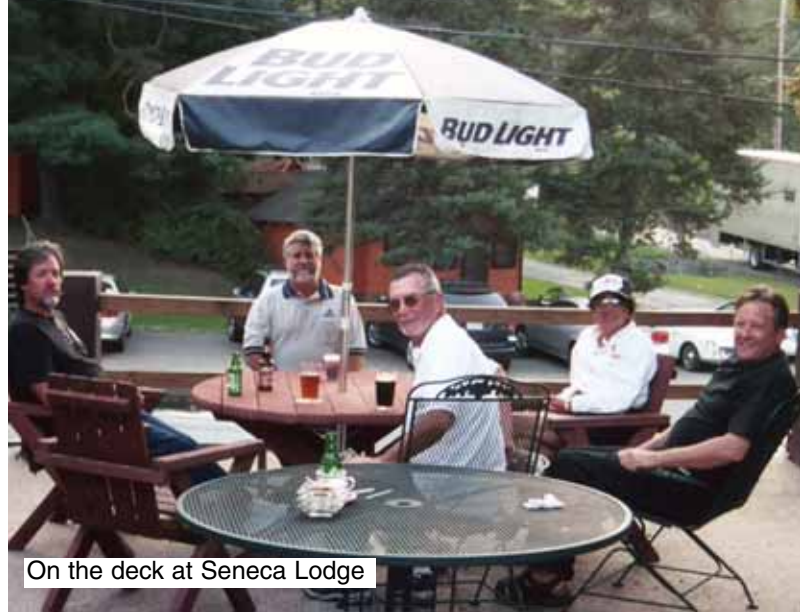
On the deck at Seneca Lodge