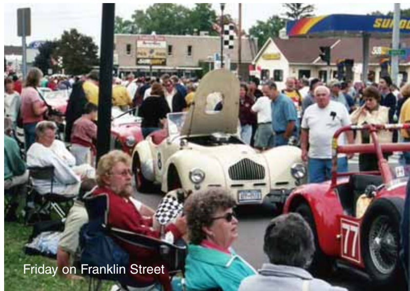
Friday on Franklin Street