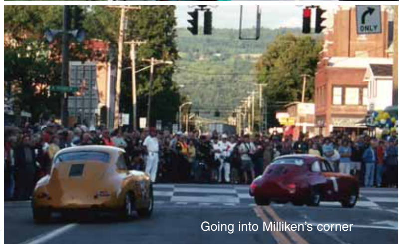
Going into Milliken's corner